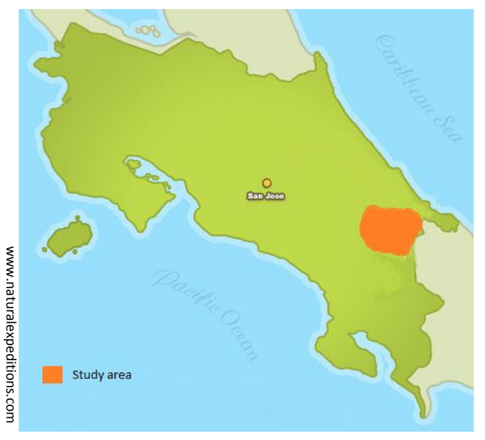
Figure 1: study area - Bribri-Cabécar Indigenous Territory Talamanca

In Costa Rica plantains are mainly cultivated in the region of Talamanca, located in the south of the country. Talamanca is the region with the lowest Human Development Index in Costa Rica (PNUD-UCR 2007). The Bribri and Cabécar Indigenous Territories (see Figure 1) are a part of Talamanca and within these territories many households economically depend on the production of plantains. People within these territories have few economical resources, are (geographically) isolated and have limited access to information, health and educational facilities (Barraza, et al. 2011; Fieten, et al. 2009; Polidoro, et al. 2008; Rioux-Pelletier 2009). This research took place in the communities of Amubri, China Kicha, Gavilan, Katchabri, Katsi, Sepecue, Shiroles and Suretka (in alphabetical order).